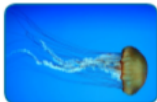
A large, brown jellyfish.

Jellyfish live in the sea all over the world. They have been on our planet for millions of years. Some kinds of jellyfish were even around before the dinosaurs.