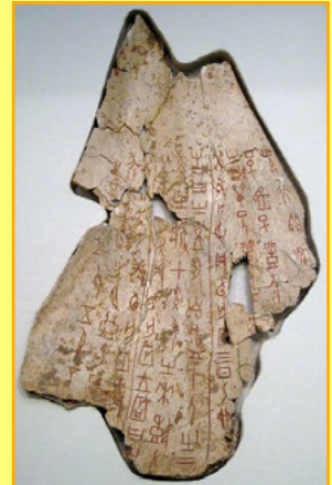
An example of an oracle bone

Around the year 200 BC, historians started to write down what they knew about the kings of the Shang Dynasty. They recorded their names and the order they reigned. More than 2,000 years later, oracle bones were discovered with writing on which described the kings and when they ruled. Some of the information was different to that in the history books so which evidence is correct?