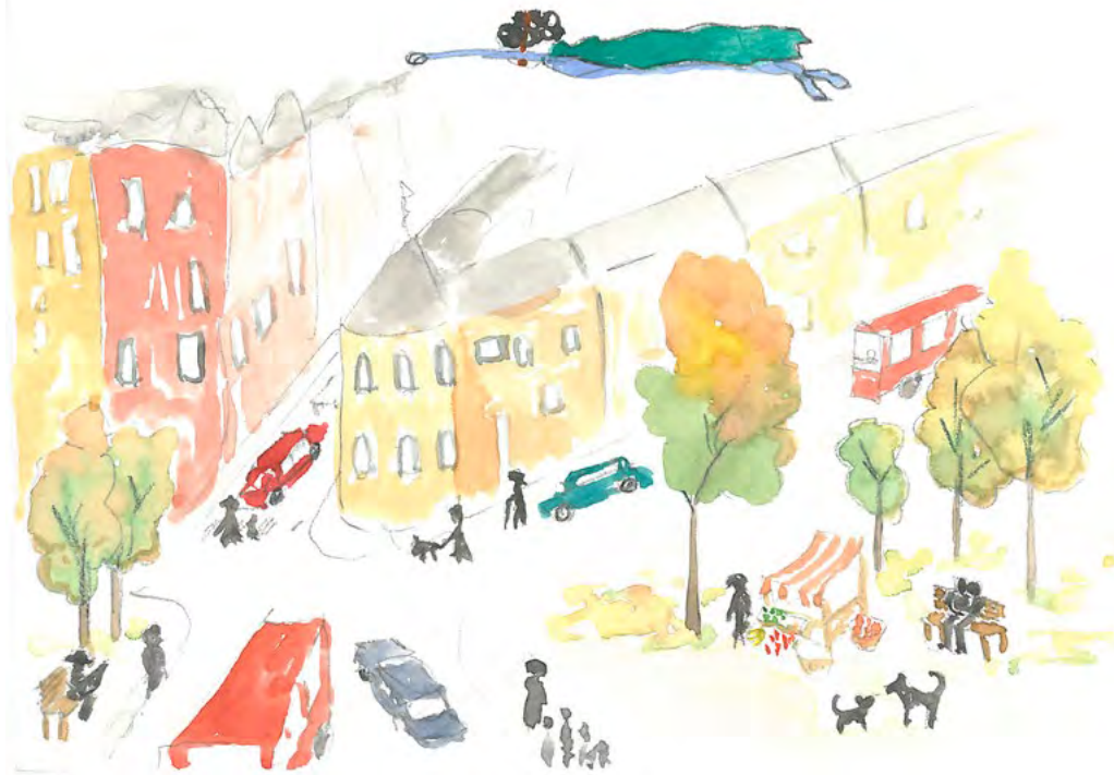
There are town superheroes....