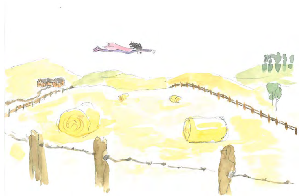
... and country superheroes.