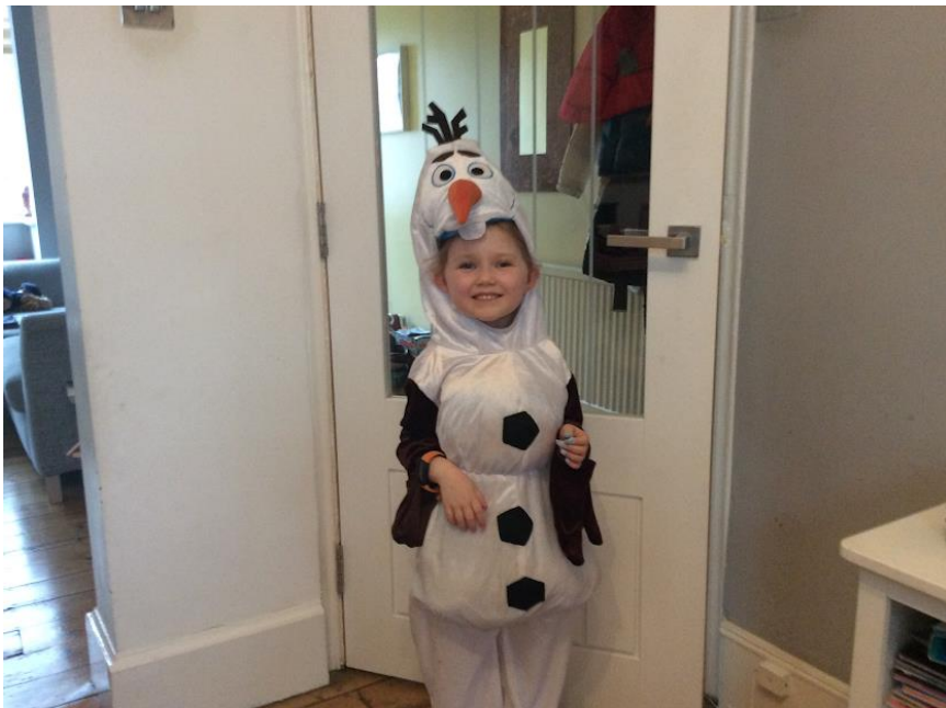
Caring, Learning and Achieving together as part of God's Family