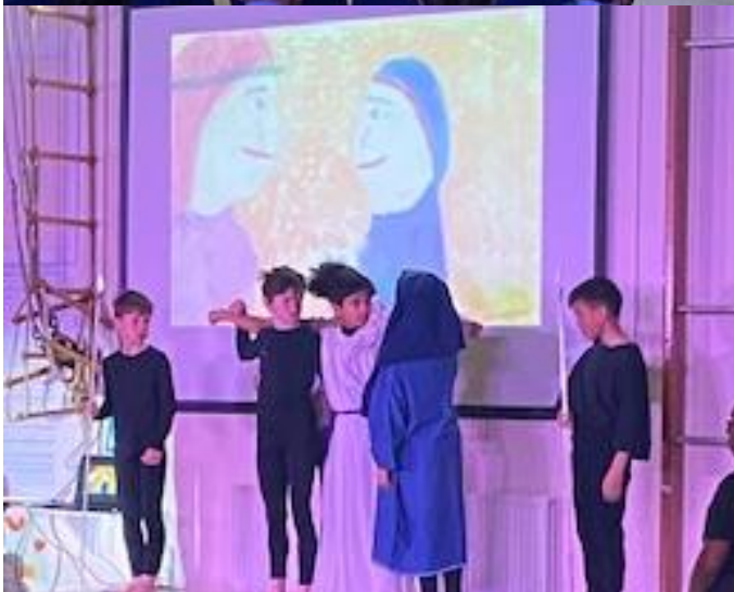
Some pictures from our very moving Way of the Cross, led by Indigo Class