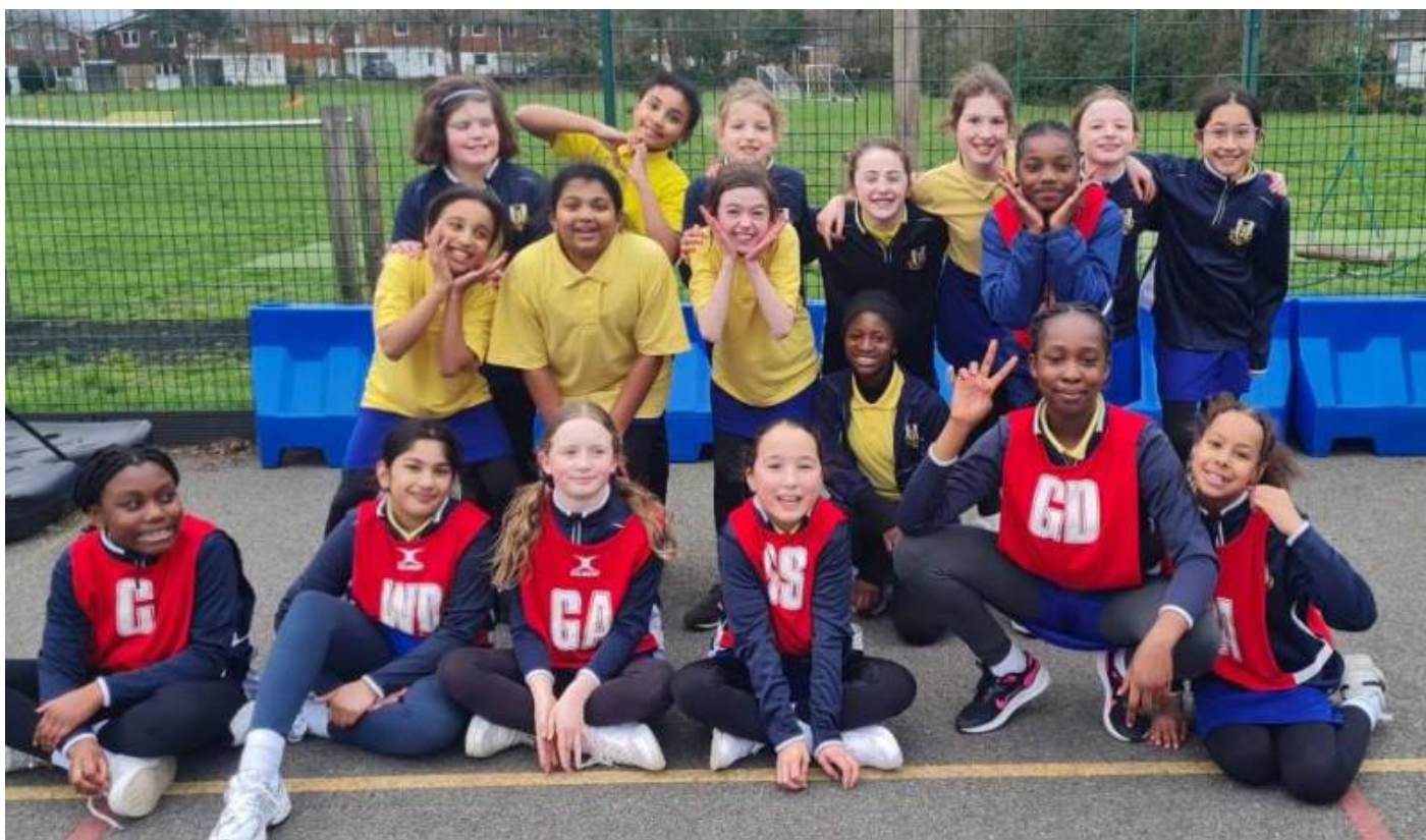
Netballers at Park Hill