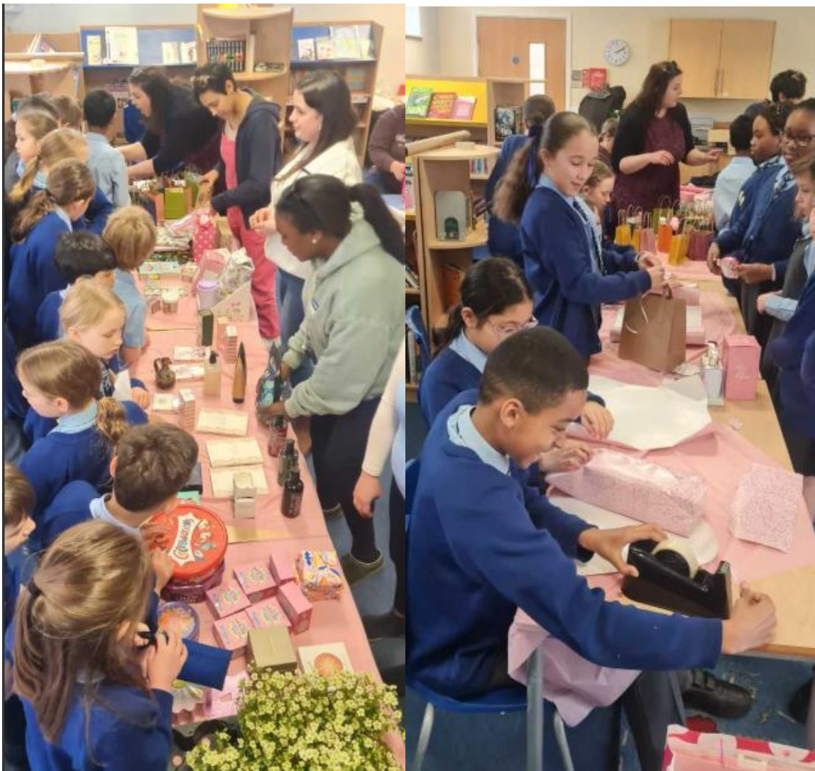
Happy gift-purchasing and expert wrapping!