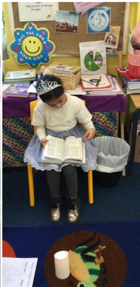
Candle lit, quietly reading the bible.