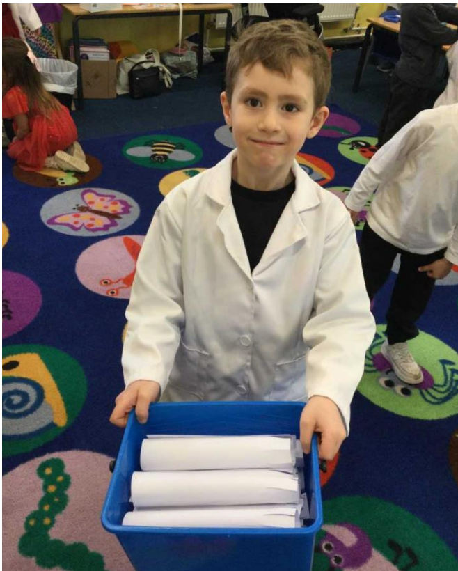
"I have made palms to welcome Jesus!"

I popped into St Rose Class last week and was enchanted to see how the children were thinking about Lent and Holy Week in their creative play.